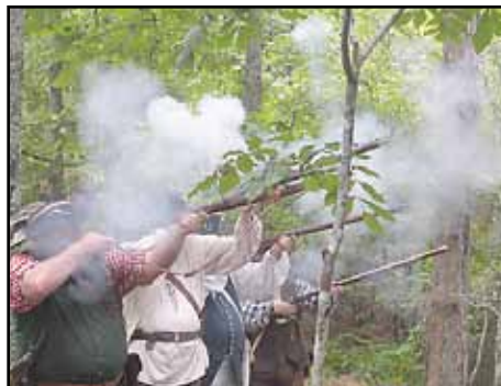
SCSSAR Color Guard renders a musket salute.