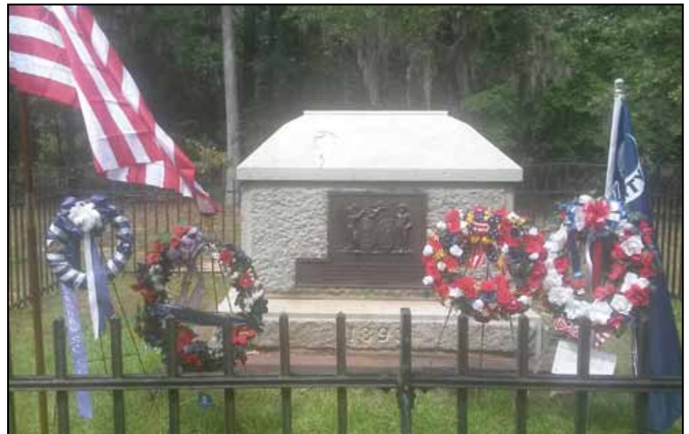
FRANCIS MARION GRAVESITE