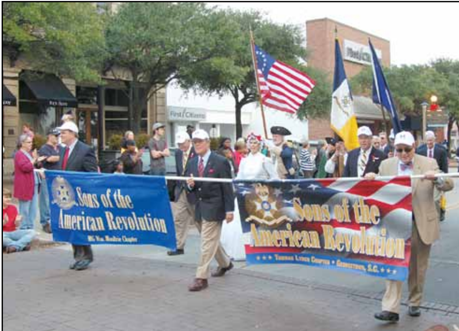
VETERANS DAY PARADE – The Col. Lemuel Benton Chapter of Myrtle Beach, Major Gen. William Moultrie Chapter of Charleston and the Thomas Lynch Chapter of Georgetown participate in the Georgetown Veterans Day Parade Nov. 11.