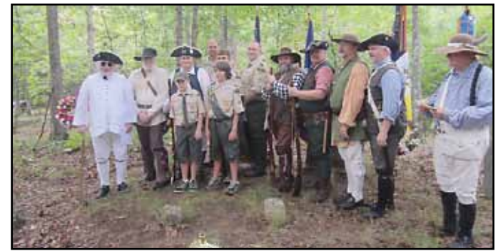
Members of the SCSSAR and NCSSAR Color Guard at the grave site with area Boy Scouts.