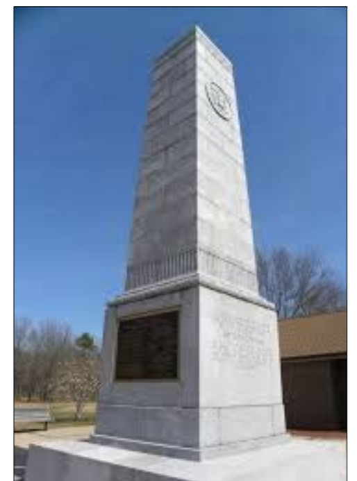
United States Monument at Cowpens National Battlefield

Again, all members of the chapter are encouraged to participate in this annual observance which was the first historic event official recognized as a National event by the SAR.