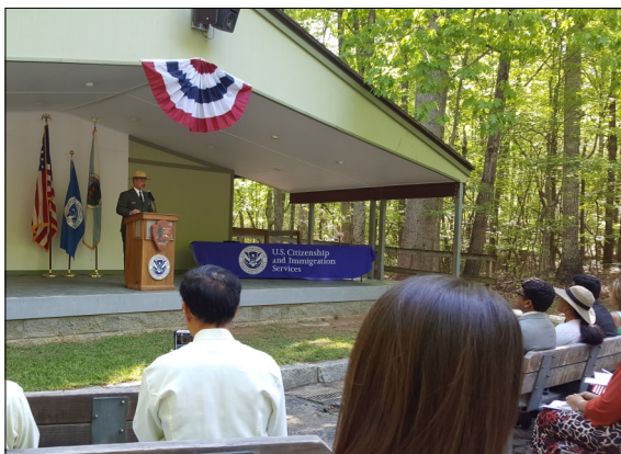
New Citizen Naturalization Ceremony

The chapter was named the 2016 Large Chapter of the Year in the South Carolina SAR at the 2017 Annual State Meeting in April.