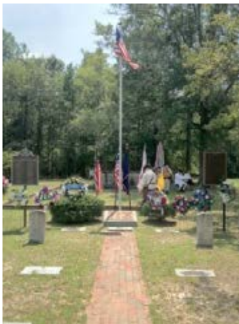
The SAR Memorial at Quaker Cemetery