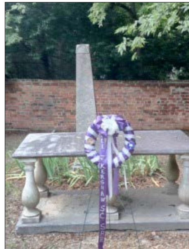
The Colonel Joseph Kershaw Gravesite