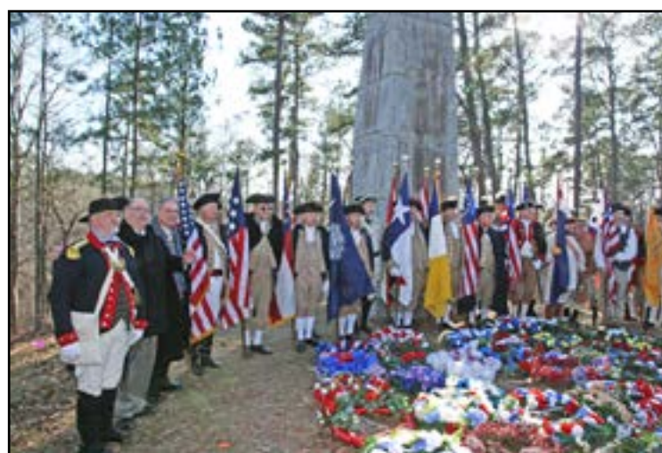
Massed NSSAR Color Guard stands in front of the monument on the summit of War Hill after the wreath presentation.