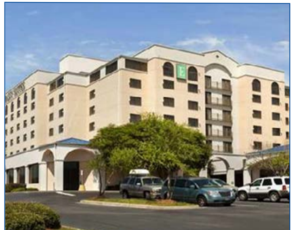
The Embassy Suites Greystone will host the 2015 Annual Meeting.