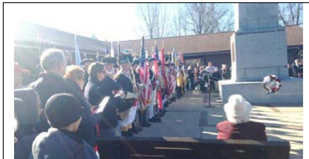
NSSAR Color Guard forms at the National Monument prior to the wreath laying