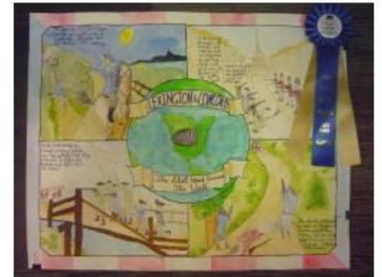
The Americanism Poster Contest

“The objects of this Society are declared to be patriotic, historical, and educational....” -Constitution of the SAR Article II